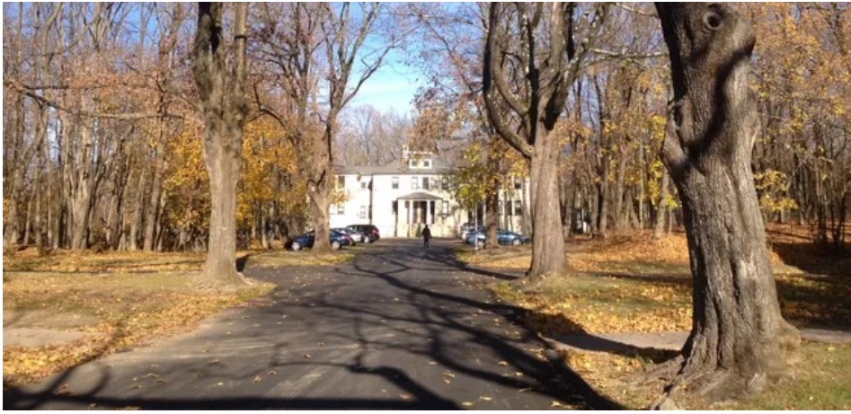
Cottages at the Pleasantville Cottage School, one of two residential treatment centers for troubled youth in the town of Mount Pleasant.

Simply mentioning concern for children’s mental health is not enough. New York State needs to prioritize providing care for those children and families in the child welfare system before it is too late. We need support to increase staffing for those providing care in group homes, foster care and residential treatment center. There is a wave of bad consequences which is about to come crashing down on all of us. Program providers — like group homes — can’t pay staff enough to keep them working in these jobs. The vast majority of those working these often emotionally difficult jobs do so because they care about the children and families they are helping and understand that they are making a difference. However, some staff feel pushed to their own economic breaking point and forgo positions helping our kids for less rewarding but higher paying jobs. With less staff, we can serve fewer children and families and, for our staff who stay in these positions, it is becoming increasingly likely that they get burned out and also leave for other professions which means we can serve even fewer children.